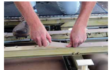
Easy to installation and pliability